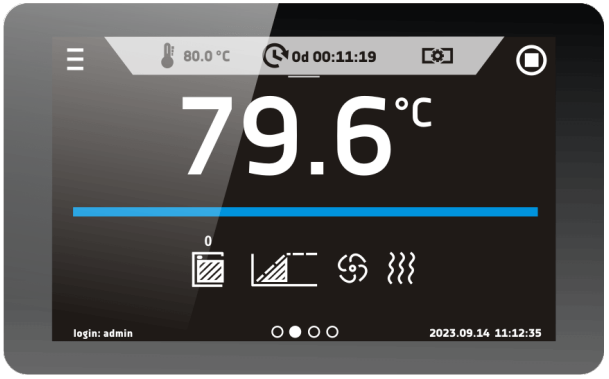
Smart PRO - preview screen